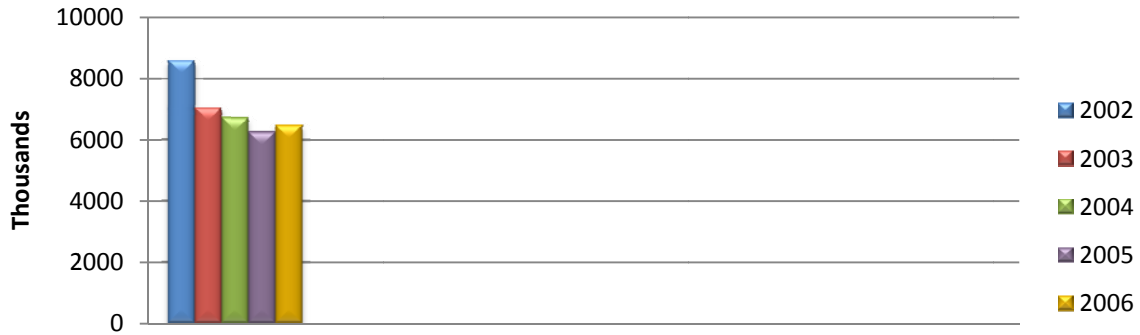
Figure 9R-3 United Way Employee Contributions