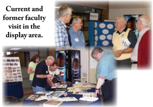
Current and former faculty visit in the display area.