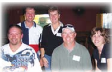
Social at Howie's