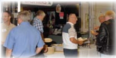
Lunch in the TC Café