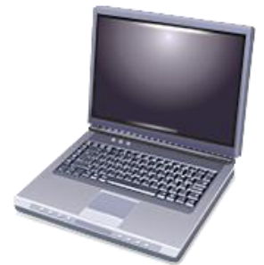
Laptops are available for faculty and staff checkout.

Librarians and staff at Western Library assist library users in a variety of ways regarding the information literacy process. Library instruction is offered via class-related sessions, library tours are given, workshops are conducted for various groups, and one-on-one sessions occur routinely. As students get exposed to class-related library instruction sessions, work with librarians in learning to use the library, and utilize library resources, they develop the information literacy skills so essential in the overall educational process.