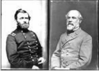
Ulysses S. Grant and Robert E. Lee

A Civil War theme depicting items the everyday soldier might have carried is on display in the Western Library. The reproductions, circa 1861-1865, include a variety of memorabilia from this era. A walking stick, lice comb, bullet mold and bullet, sewing kit, eye glasses, and hardtack are