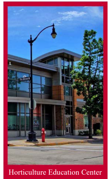
Horticulture Education Center

15. Horticulture Education Center: Located at 624 Vine Street, this 11,121 square foot facility was completed in 2015 (Headhouse 3,467 square feet, Greenhouse 7,654 square feet) allows access to Western programs, including Landscape Horticulture, Culinary, and Science. Western, GROW La Crosse, and Mayo Clinic Health System-Franciscan Healthcare have developed a unique partnership with this facility to promote healthy eating habits and foster education about gardening, agriculture, and sustainable practices.