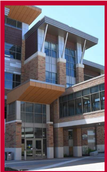
Integrated Technology Center

extensive remodel of the first two floors, and the addition of two floors included rigorous efforts to increase energy savings and reduce the use of materials intended for landfills. The building is certified as LEED Platinum. This facility includes the Integrated Technology Division office and the following program areas: Agri-Business Science Technology; Architectural Technology; Automation Systems Technology; Building Construction and Cabinetmaking; Building