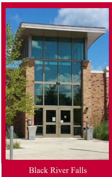
Black River Falls

Located at 24 Fillmore Street, this 20,686 square foot single-story facility houses general classrooms, three distance learning classrooms, a distance learning conference room, two computer labs, Learner Support and Transition classrooms, a Nursing Lab and classroom, a student resource room, student lounge, large classroom, staffing offices, computer