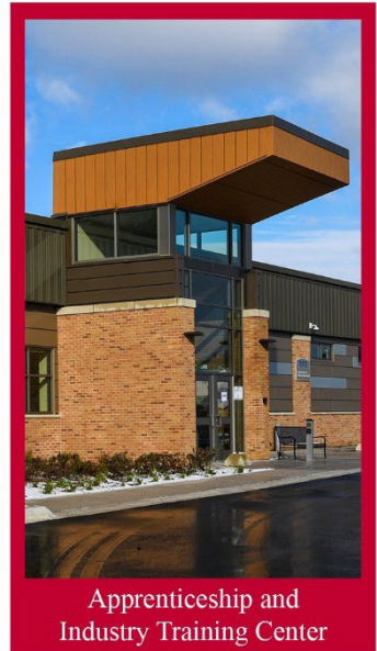
Apprenticeship and Industry Training Center

The new spaces include an additional computer lab, additional offices for instructors and adjunct instructors, additional parking, a dedicated welding lab for contract training, and plumbing and electrical labs that provide hands-on practice through installation. The facility maintains a flexible learning space capable of accommodating future programming in automation, construction, or any other need.