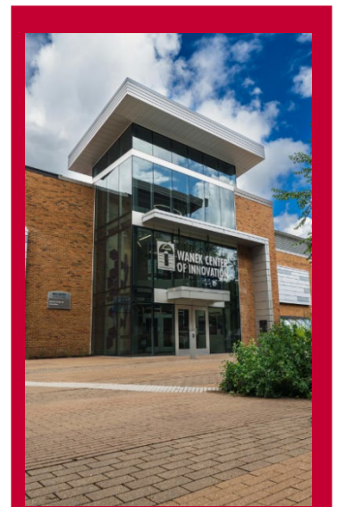
Wanek Center of Innovation

square feet and has the potential for two additional floors of expansion. It was built in 1973 and underwent remodeling during the summers of 2013 and 2017. In 2025, the building was renovated to accommodate the Advanced Manufacturing laboratories, open workspaces, K-12 academy spaces, and student collaboration zones. The project is a collaborative investment, with most of the funding coming from a donor to transform the facility. The